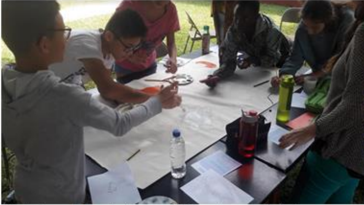
Students collaborated on a painting using symbols they designed from an earlier activity