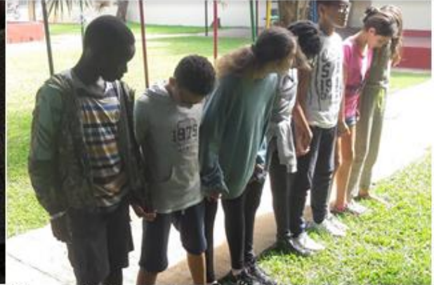
Communication and teamwork! Students walked one meter with their feet touching. It sounds easy, but was a fun challenge.

On Thursday afternoon the middle and high school students came together for an afternoon “retreat” on the BAIS campus. The main aim was to wrap up our first unit on social and emotional learning (and have fun while doing it!). Using The Seven Habits of Highly Effective Teens written by Sean Covey throughout the unit, students grappled with big ideas and skills like identifying their sphere of control, making sound goals, prioritizing, listening, synergizing/working together, reflecting, and taking care of themselves.